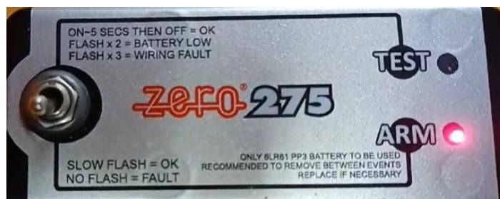
System armed – ready to be used