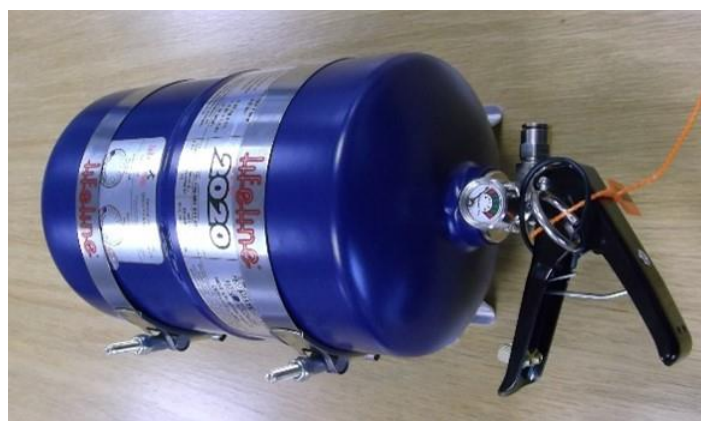
System with safety pin - not ready to be used